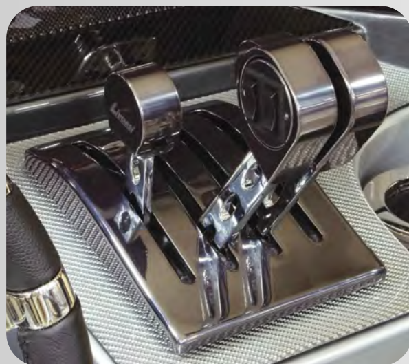
Twin engine Billet controls with Contour base and knobs in Black Smoke